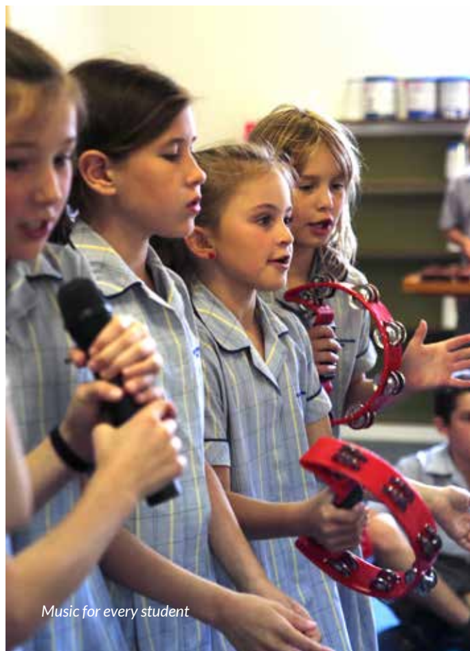
Music for every student