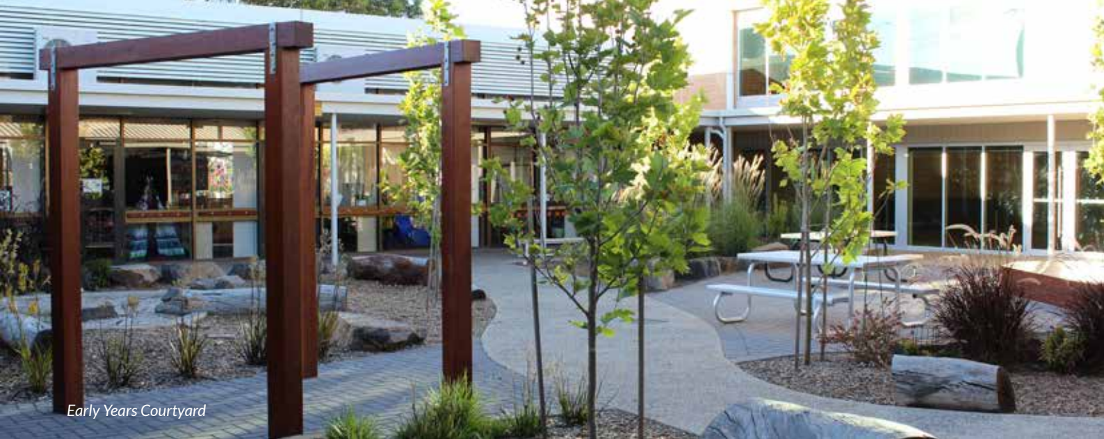
Early Years Courtyard