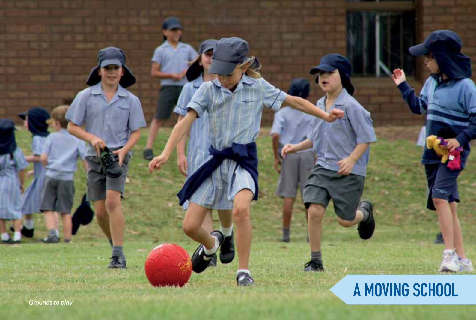
Grounds to play